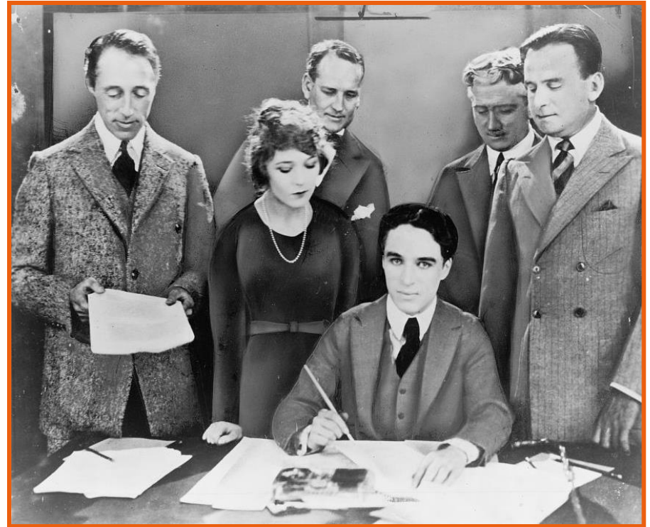
United Artists Contract Signature, available from https://upload.wikimedia.org/wikipedia/commons/3/39/United_Artists_contract_signature_1919.jpg , public domain